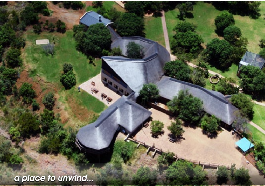
a place to unwind...